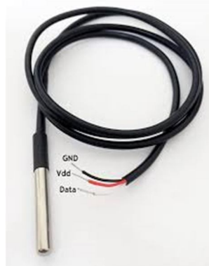
Fig3:DS18B20 temperature sensor

3) PIR sensor : PIR sensor is an optoelectronic sensor which works on the principle of light reflection by interacting bodies. Human beings can't recognize infrared beams however transmits infrared from the body as warmth like all other warm blooded (creatures in which body temperature stays steady Mammals and Birds). This is used in Motion finders to identify the nearness of people. PIR sensors (Passive Infra-Red sensor) are utilized to actuate an alert framework utilizing the Infrared signals reflected by the body of the intruders in this particular case. PIR sensor is an electronic gadget that measures the infrared in its field of view. Development is identified by the sensor when an infrared source like human goes before the sensor with one temperature and contrasting another temperature like that of the divider in which the sensor is mounted.