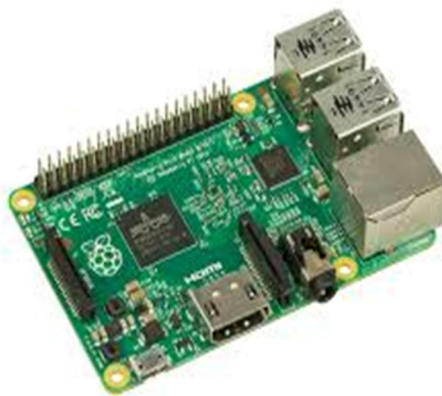
Fig 2: Raspberry Pi 2 Model B

Each DS18B20 has a unique 64-bit serial code, which allows number of DS18B20s to function on the common 1-Wire bus. Thus, it is simple to use one microprocessor to control numerous DS18B20s spread over a large area. Thus this sensor is very useful in applications like HVAC environmental controls, process monitoring and control, temperature monitoring systems inside buildings, and equipment, or machinery.