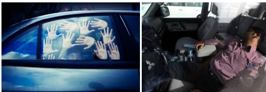
Fig.2 Suffocation Death in Car