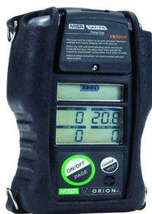
Fig. 1 MSA Multigas detector