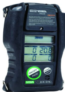
Fig. 1 MSA Multigas detector