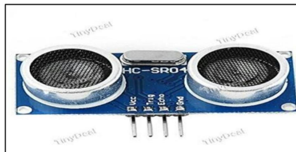
Fig .3 Ultrasonic sensor

The capacitance accelerometer senses changes in capacitance between microstructures located next to the device. If an accelerative force moves one of these structures, the capacitance will change and the accelerometer will translate that capacitance to voltage for interpretation.