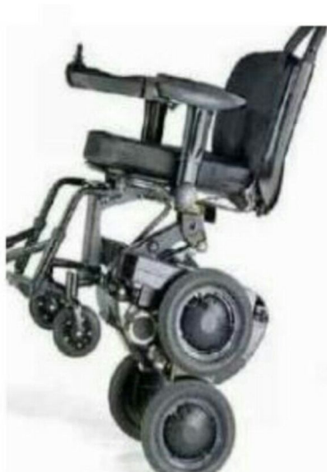
Fig .5 Planetary Wheels

Joystick A is an input device have a stick that fix on a base and reports its angle or direction to the device it is controlling. A joystick, also known as the control column, is the main control device in the cockpit of many civilian and military aircraft, either as a center stick or side stick. It often has another switches to control various aspects of the aircraft's flight. Joysticks are used to control video games, and usually have one/more push-buttons whose state can also be read by the computer. Joysticks are also used for controlling machines such as cranes, trucks, underwater unmanned vehicles, wheelchairs, surveillance cameras, and zero turning radius lawn mowers. Miniature finger-operated joysticks have been adopted as input devices for smaller electronic equipment such as mobile phones