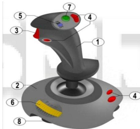
Fig .4 Joy-Stick

A short ultrasonic pulse is transmitted at the time 0, reflected by an object. The sensor receives this signal and transfer it to an electric signal. The next pulse can be transferred when the echo is faded away. This time period is called cycle period. The recommend cycle period should be no less than 50ms. If a 10\mu\text{s} width trigger pulse is send to the signal pin, the Ultrasonic module will output eight 40 kHz signal and sense the echo back. The measured distance is proportional to the echo pulse width and can be find by the formula above. If no obstacle is find, the output pin will give a 38ms high level signal.