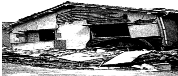
Figure 1: Effect of Earthquakes Buildings

An earthquake is a trembling or a shaking movement of the ground, caused by the slippage or rupture of a fault within the Earth's crust a sudden slippage and rupture along a fault line results in an abrupt release of elastic energy stored in rocks that are subjected to great strain