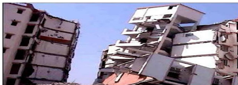
Fig. 2:- Collapse of a Building

An Earthquake (also known as a quake, tremor and temblor) is the result of a sudden release of energy in the earth's crust that creates seismic waves earthquakes are measured using observations from seismometers An earthquakes point of initial rupture is called its focus or hypocenter the epicenter is the point at ground level directly above the hypocenter In Nepal there are three major fault lines (ICIMOD, 2007) the main central thrust (MCT) at the foot of the greater Himalaya joining the midland mountain but the main boundary fault (BMF) at the junction of the lesser Himalaya This faults line is the main cause of movement of Indian plates going under the Eurasian plates The first earthquake was reported by Nepal in 1255 AD then after there were several earthquakes reported but the earthquake occurred in 1934 (Bihar-Nepal) is quite devastated for Kathmandu valley I have written this paper for improvement of the quality of the construction as well as the cost effective solutions for constructing seismic resistant houses in developing countries like Nepal India I have also used the horizontal bands proper bindings of the joints either column or beams