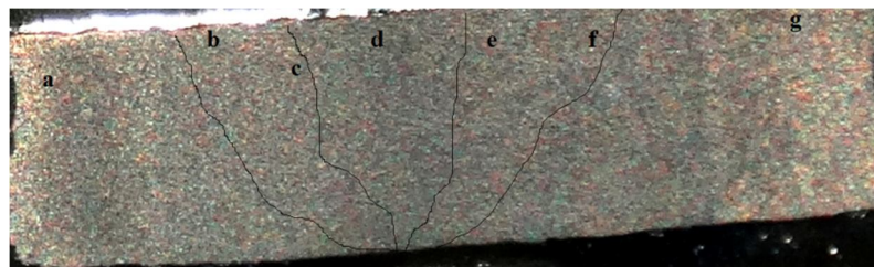
Fig 3 Macrostructure conical threaded pin

From the macro-graphic studies, different regions of weldments are identified and it represents the effective stir of both base material in the stir zone in fig 3. Defect free welds were produced on using conical tapered pin with process parameter of 710 rpm, 28mm/min.