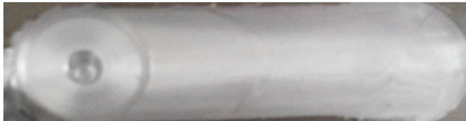
Fig 2 Surface morphologies of weld without defects

The surface morphology of the weld fabricated using conical tapered pin profile shown in fig 2. The rotational speed and the traverse speed were maintained at 710 rpm, 28mm/min and 1120 rpm, 60mm/min respectively. By varying the process parameters, no external defects were found on the weld