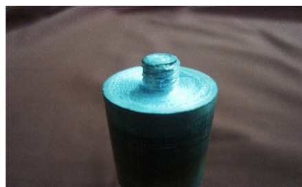
Fig; 2 Tool used for FSP

The FSP was carried out using an indigenously built FSW machine (M/s RV Machine Tools, Coimbatore, India) at the centre of the plate. The FSP parameters employed were tool rotational speed 1200 rpm, traverse speed 56 mm/min, The press-in depth of the tool shoulder into the plate was set to 0.1 mm, axial force 9 kN and number of passes 1 and 2. A tool made of HCHCr steel, oil hardened to 62 HRC having a threaded profile was used Fig.2. The tool had a shoulder diameter of 18 mm, pin of 4.5 mm diameter and pin length of 5 mm. A specimen was obtained from each friction stir processed plate by cutting in the centre of the plate perpendicular to FSP direction. The specimens were polished as per standard metallographic procedure and etched using Keller's reagent.