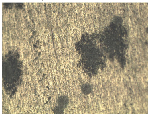
Fig.4. Microstructure of the etched specimens

The digital images of the macrostructure of the etched specimens were captured using a digital optical scanner Fig 4 The microstructure was observed using an optical microscope.