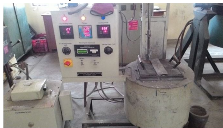
Fig; 1 Furnace used for In-Situ Fabrication of MMCs

In situ aluminum matrix composites (AMCs) were typically produced through one or more reactions between aluminum and oxide ceramics such as TiO 2 [1,2], SiO 2 [3] and ZrO 2 [4,5]. These composites are applications due to their high specific strength and toughness, good thermal stability and wear resistance. The casting methods used for fabricating in situ AMCs [6]. Aluminum rich intermetallic particles such as Al 3 Ti, Al 3 Zr, Al 3 Ni, Al 2 Cu and Al 3 C4 are potential reinforcements for Discontinuously reinforced aluminum matrix composites (DRAMCs) because they have a low density and coefficient of thermal expansion, high modulus and melting temperature and good recycling behavior. Moreover, they are in thermodynamic equilibrium with the aluminum matrix which enables to create a real chemical bond between the aluminum matrix and the intermetallic particle [7–9]. Liquid method of processing is effective owing to its simplicity, easy of adaption, and applicability to large quantity fabrication. Liquid method of processing involves either adding ceramic particles externally to the molten metal or synthesizing in the melt itself. In-situ fabrication involves synthesizing the reinforcements by chemical reactions between elements or between elements and compounds. Fig.1 shows the in-situ fabrication of MMCs schematically.