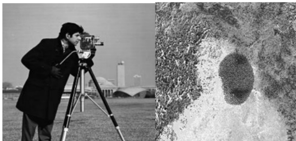
Fig.2 Original Image 1

We have taken different images and encrypted using our proposed algorithm and the results are shown below.