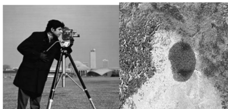
Fig.4 Decrypted Image 1