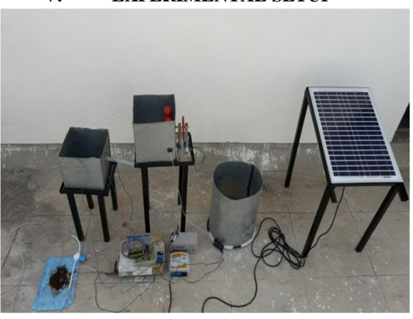
Fig. Experimental setup