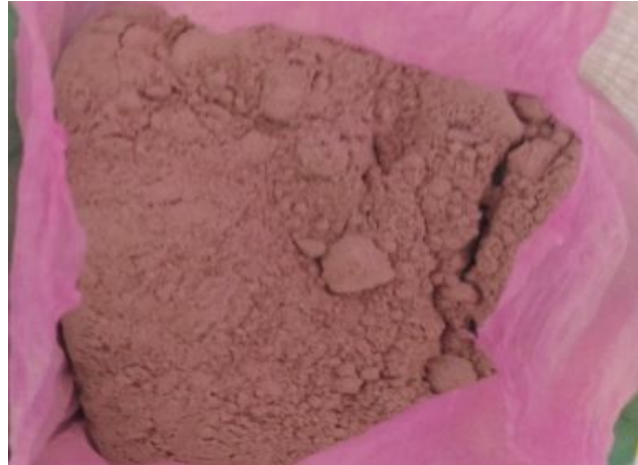
Fig.1 Granite powder

The dust is collected from kinathukadavu near the coimbatore. The quarry dust is the by product which is formed in the processing of the granite stones which broken down into the different size of coarse aggregates.