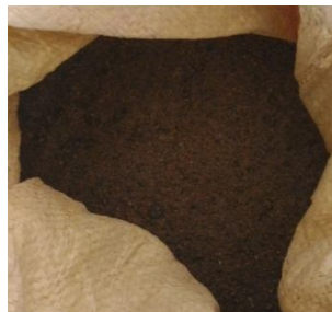
Fig.2 Quarry dust

In addition to granite powder, silica fume, fly ash, pumice powder and ground granulated blast furnace slag are widely used in the construction sector as a mineral admixtures instead