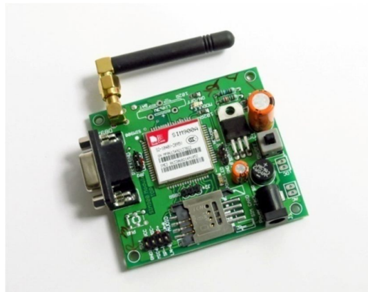
Fig. GSM module

GSM/GPRS RS232 electronics equipment from rhydoLABZ is made with SIMCOM build SIM900 Quad-band GSM/GPRS engine, works on frequencies 850 megacycle per second, 900 MHz, 1800 megacycle per second and 1900 megacycle per second. it's terribly compact in size and simple to use as infix GSM electronic equipment. The electronic equipment is intended with RS232 Level device electronics equipment, that permits you to directly interface laptop port .The baud may be configurable from 9600-115200 through AT command. at first electronic equipment is in Auto baud mode. This GSM/GPRS RS232 electronic equipment has internal TCP/IP stack to alter you to attach with web via GPRS. it's appropriate for SMS likewise as knowledge transfer application in M2M interface. The electronic equipment required solely three wires (Tx, Rx, GND) except Power provide to interface with microcontroller/Host laptop. The inbuilt Low Dropout Linear transformer permits you to attach big selection of unregulated power provide (4.2V -13V). Yes, five V is in between !! .Using this electronic equipment, you'll be able to send & browse SMS, hook up with web via GPRS through easy AT commands.