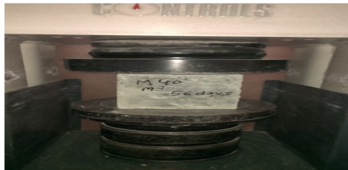
Figure 1 Compression Strength Test in CTM