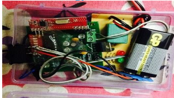
Fig.1. RF module system