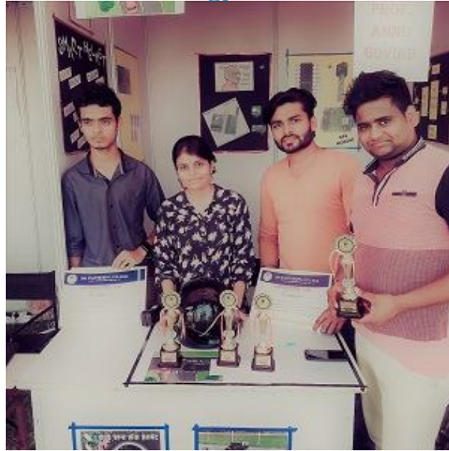
WON CONSOLATION PRIZE IN TECHNOVATION 2017