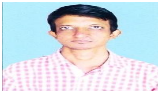
Fig6: NAGARJUNA SAGAR TEAM

The following are the images that children are playing this game