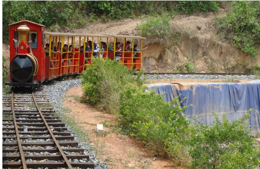
Fig 3 Project Site: Mini-Train