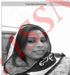
WM image (bit 2)