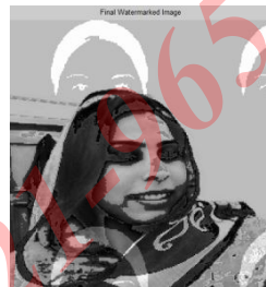
WM image (bit 7)