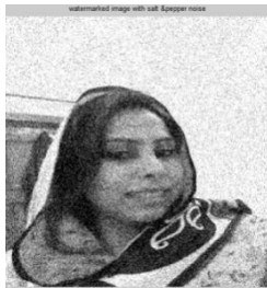
Salt & Pepper Noise