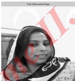
WM image (bit 4)