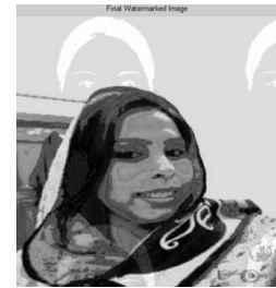
WM image (bit 6)