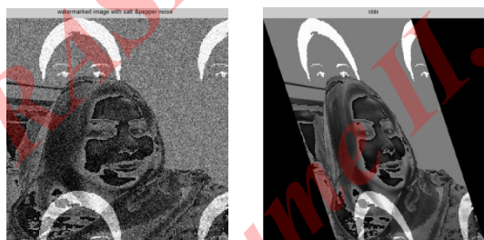
Salt & Pepper Noise