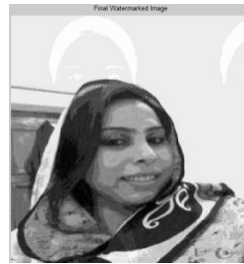
WM image (bit 5)