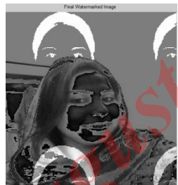
WM image (bit 8)