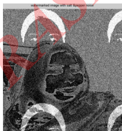
Salt & Pepper Noise