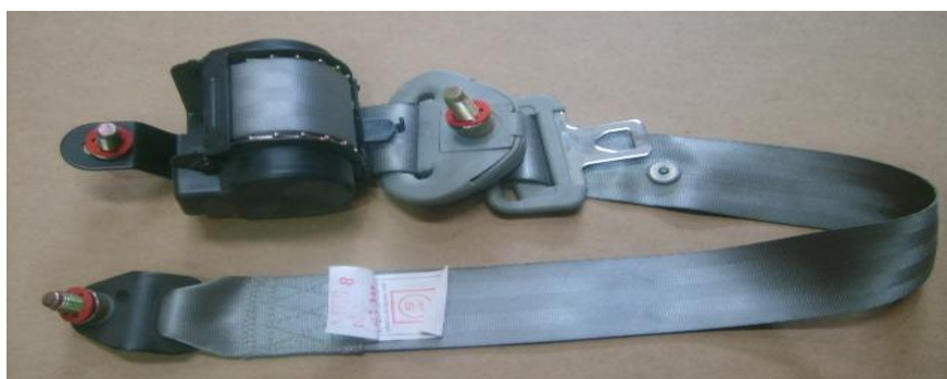
Fig. 3 Seat & belt lock