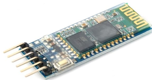
Figure: - Bluetooth Module

Where; Pr is power strength in dB E is level in dB ( \mu\text{V/m} ) d is distance between Bluetooth module and antenna Basically, the received power from Bluetooth module (Blue Bee) is \geq 4\text{dBm} which is Class 2 radio.