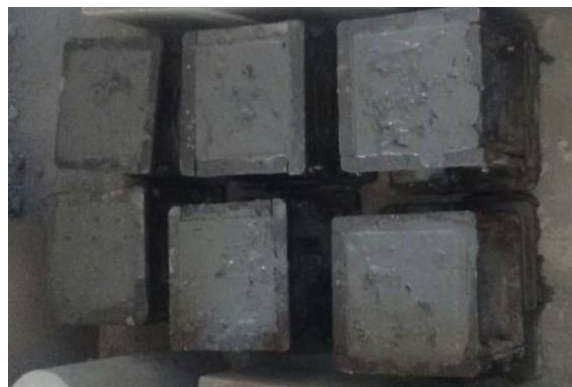
Fig.2-moulds are prepared