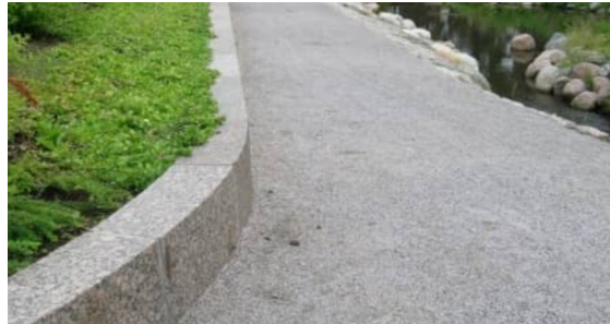
Fig.1 Stone dust used for yard construction