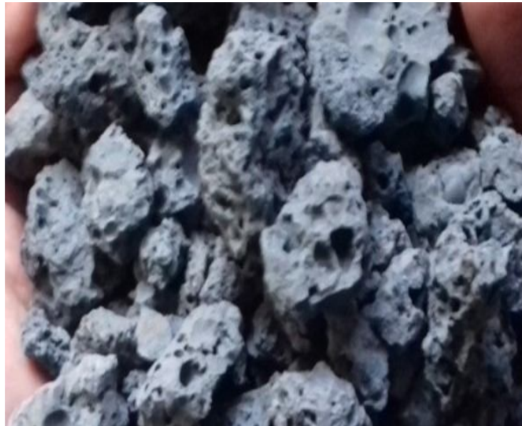
Fig 1 Electric Arc Furnace Slag

Electric arc furnace slag, an industrial by-product of steel and iron manufacturing industry, must be recycled because it has increased proportionately with the development of the steel industry. Big steel plants in India generate about 29 million of tonnes of waste material annually. The waste produced from steel industry are dangerous for both industry as well as human life so it can be used in construction work so that slag can be utilized in a better manner. Electric arc furnace slag has a high specific gravity; it can produce heavy weight concrete if used as an aggregate for structural concrete. Since most heavy weight aggregates are obtained naturally, substitute aggregates must be developed for environmental preservation and protection. From this point of view, the use of EAF slag as aggregates holds great significance.