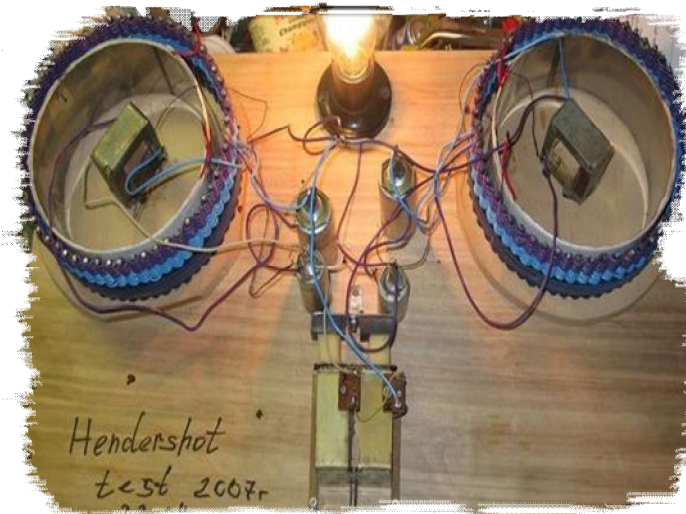
Fig.2: Hendershot fuelless generator with dummy load

The fuelless motor works on compass, and the original model would always operate when pointing north or south, as does the compass, but it will not move when pointed east or west. The great scientist Hendershot worked two years to overcome the defect, and finally he brought a motor to the Bettis field that appeared to be working perfectly. A small model airplane with this motor but this experiment fail it crashed to the ground during one of the experiments. By improving the motor.