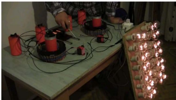
Fig1. Hendershot fuelless generator

on To test the generator, plug an appliance in the socket on the wooden board. Now by moving the sled with the two small coils towards the magnet. By Adjusting the sled's position for best power output. But we have to very careful that not to touch the iron bar with the 2 small coils.