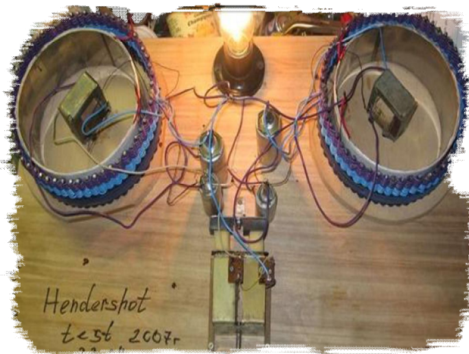
Fig.2: Hendershot fuelless generator with dummy load

The fuelless motor works on compass, and the original model would always operate when pointing north or south, as does the compass, but it will not move when pointed east or west. The great scientist Hendershot worked two years to overcome the defect, and finally he brought a motor to the Bettis field that appeared to be working perfectly. A small model airplane with this motor but this experiment fail it crashed to the ground during one of the experiments. By improving the motor.