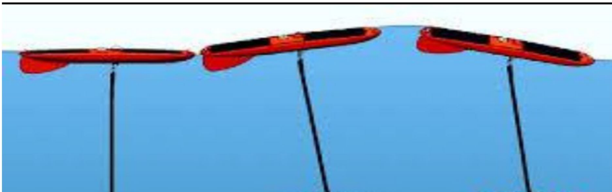
Fig2.3 the Design of the Glider

The Wave Glider vehicle has been intended to withstand extensive vast sea waves and solid winds with its position of safety surface buoy, high-quality tie and strong submerged lightweight flyer. While studying along the Alaska drift, the Wave Glider effectively worked in waves more than 6 m high and winds more noteworthy than 26 m/s (50 ties). The Wave Glider was furnished with a custom umbilical link and payload box to give power and correspondences capacities to the tow body. The operations endured two evenings to test and approve the framework's capacity to gather steady, superb acoustic information. The information can be recovered by means of satellite association while the vehicle is sent