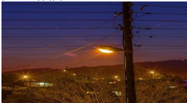
Fig 1 An Image Of Conventional Street Lighting System And Its Wasting Of Power And Resource

High-mast lighting towers are vertical, cantilevered structures that are used to illuminate a relatively large area. Although primarily used for highway intersection lighting in rural areas, they are also utilized in other large areas such as parking lots, sporting venues, or even penitentiaries. As a result, failures of these structures are critical due to the potential for them to fall across highway lanes or other. When tall masts were installed in several cities to illuminate large areas. The first known application of high-mast lighting to highways was the Heerdtter Triangle installation in Dusseldorf, Germany, in the late 1950's. It was followed by installations in other European countries including Holland, France, Italy, and Great Britain. With the passing of the Federal-Aid Highway Act of 1956, interest in High Mast lighting in this country was stimulated by the successful applications in Europe. RomanPage LayoutAn easy way to comply with IJRASET paper formatting requirements is to use this document as a template and simply type your text into it.