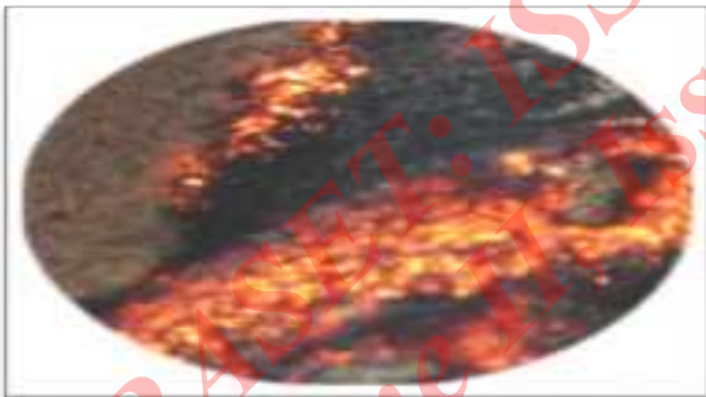
Burning rice husk