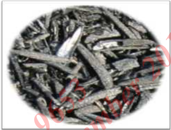
Carbonized rice husk