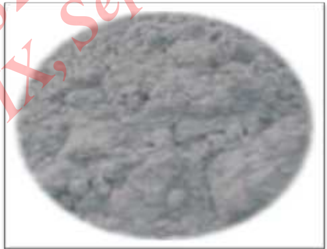
Rice husk ash (RHA)

The above figure shows how rice husk is burnt to obtain rice husk ash. If it heated in less supply of oxygen then carbonized rice husk is formed which is shown in the above figure.