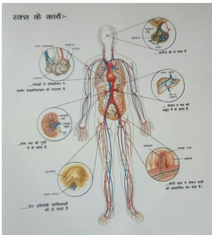
Fig. 3 Blood Circulation Mechanism

It has been keenly observed that health is a major issue in today's era. Our BCM provides a best alternative to all these problems. It improves the blood circulation in the body & enhances the reflex actions in the body & ensures the proper blood flow at all target sites in the body. Maintains the peace & state of mind & leads one to uniformity.