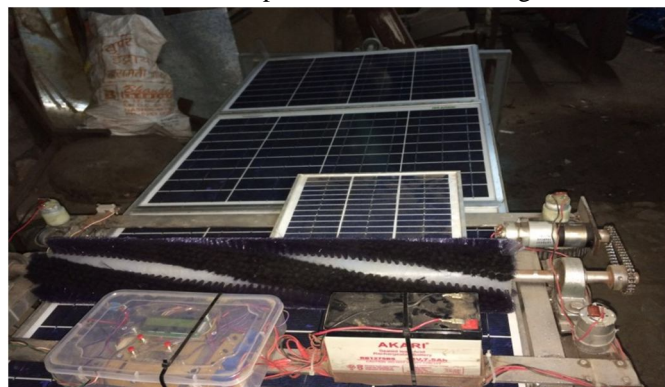
Figure No.3 Proposed Model

The frame with this assembly is mounted on four rollers; all four rollers are having individual motors of high torque and low rpm. Below frame four idle rollers are also given for travelling smoothly on solar panel frame. We have used timer circuit in our machine by which we can set how many times a day our machine will clean the solar panels. Our circuit is having only three press buttons one will start the machine and other two will increase and decrease the time in seconds, which will be shown in display. On both the ends of the machine limit switch is mounted which will stop the machine as it will go on the one end of the solar panel row.