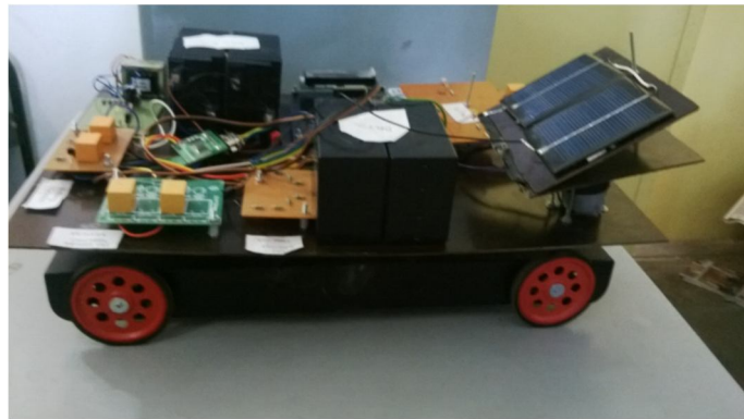
Figure 3. Hardware Assembly 2