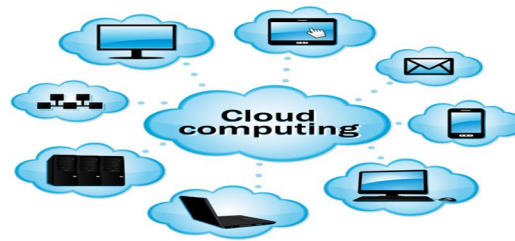
Figure 1 Cloud Computing