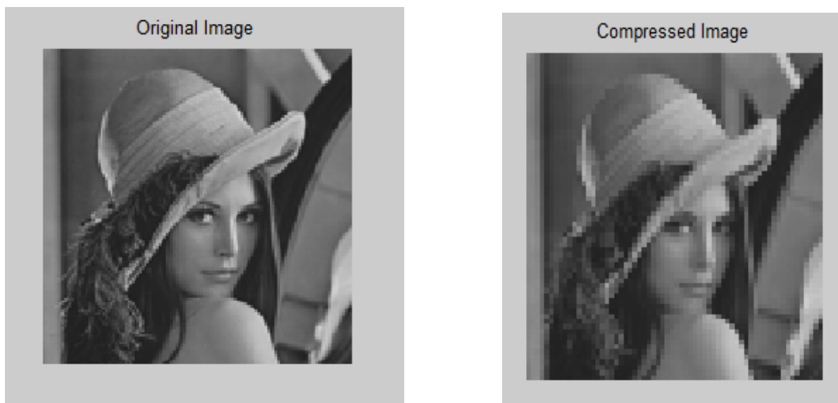
Fig. 3 – Input & Output images after implementation of FIC

The experimental results by using this technique are far better than earlier methods. The proposed QAFIC method is passed to improve the compression ratio with maintaining the good quality of retrieved images. Compression ratio (CR), quality of retrieved images, and time complexity are the most important indicators for evaluating performances of image compression algorithms. By using this method, we get compression ratio equals to 75 for 512*512 size image with good quality of retrieved image.