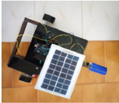
Fig 3 : Vehicle moving in forward direction