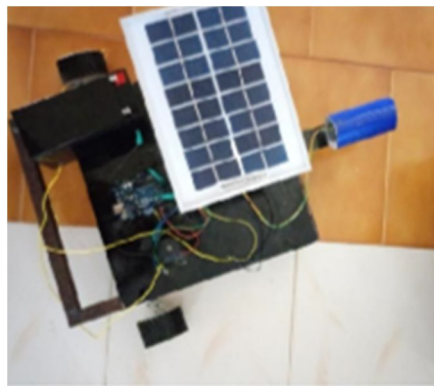
Fig 4 : Vehicle turning towards left after sensing obstacle