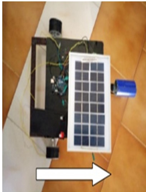
Fig 2: Vehicle turning towards right after sensing obstacle