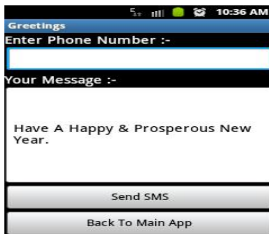
Figure 2. New Year Intent Page of Application