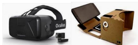
Fig1.OculusRift and Google Cardboard