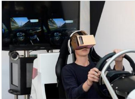
Fig 4. Driving Simulator using Google Cardboard

In due time to apply for R.T.O learning licence we had to give an online examination. We plan to replace the online test with a virtual driving test. in which the test cases will be similar to the question and will be more of life. For an example if the speed limit given 30 km/hr. and the driver goes above the speed limit then he fails at that point. Our application will be a summation of such test cases which will automatically generate result if learning licence.