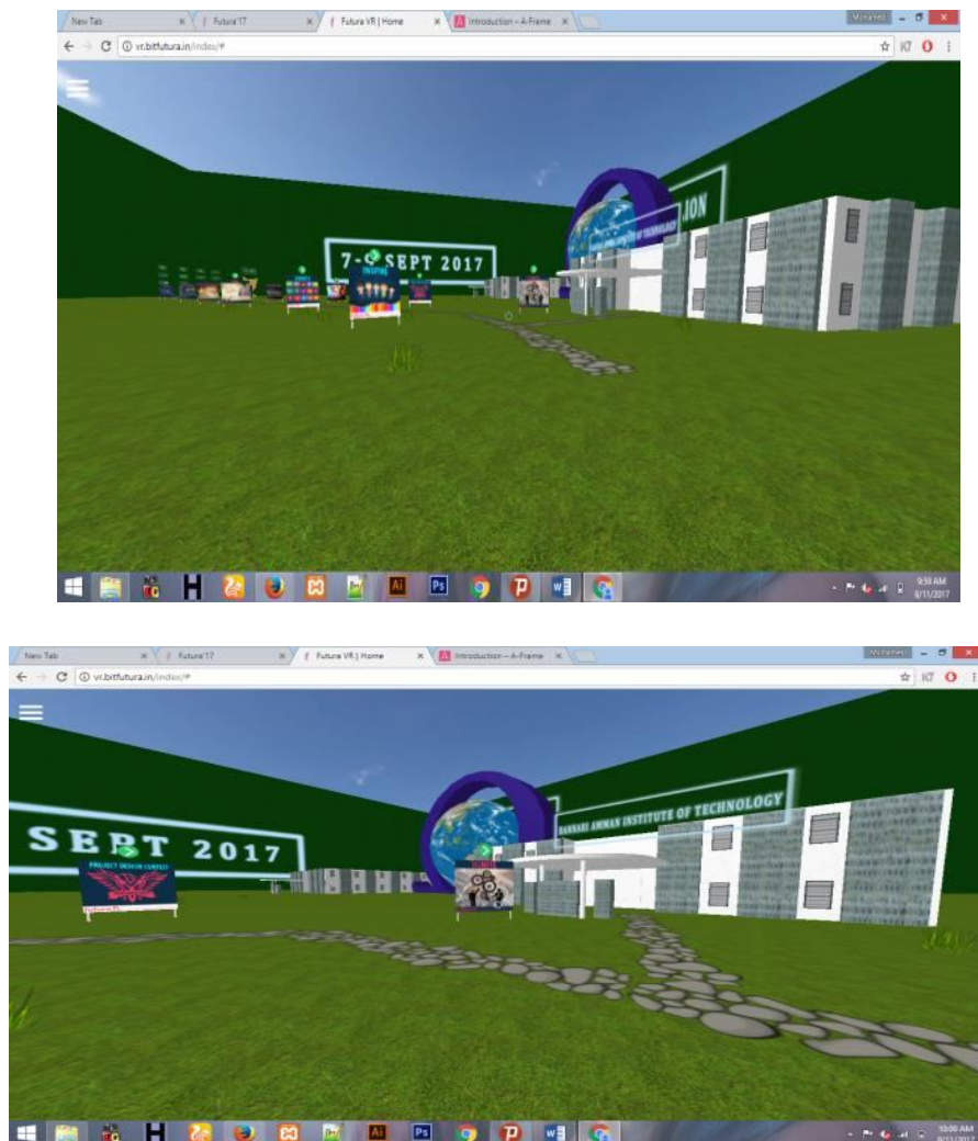
Fig 10-11 Example of Virtual Reality Website Bannari Amman Institute of technology Link- B.I.T FUTURA 2017

A-Frame supports most VR headsets such as Vive, Rift, Daydream, GearVR, Cardboard, and can even be used for augmented reality. Although A-Frame supports the whole spectrum, A-Frame aims to define fully immersive interactive VR experiences that go beyond basic 360° content, making full use of positional tracking and controllers. The Mozilla VR team is currently using A-Frame as the foundation for a Metaverse-in-progress.