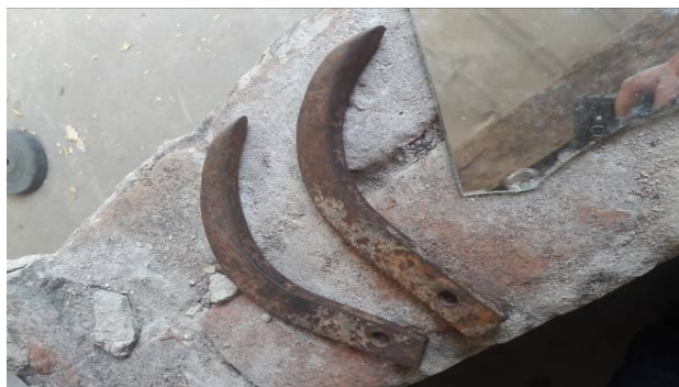
Fig.2 Furrow Opener.

On older planters, the disks may need sharpening or adjusting to properly cut the residue. As the disks wear, a gap develops and allows residue and soil to wedge between the disks. If this occurs, remove spacer washers behind the disks and adjust to maintain about two inches of blade contact on the leading edge of the double-disk seed furrow openers. When properly adjusted and maintained, double-disk seed furrow openers without coulters also can cut dry land corn or grain sorghum residue, especially if the stalks were shredded or heavily grazed.