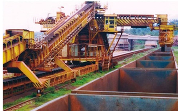
FIG 2. MOBILE WAGON LOADER