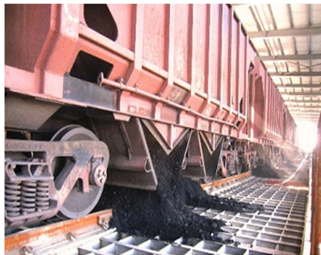
FIG 4 TRACK HOPPER UNLOADING SYSTEM